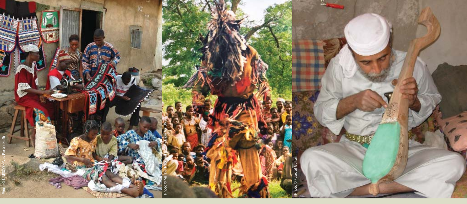
• The Oral Heritage of Gelede, Benin, Nigeria, Togo