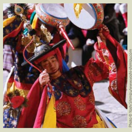
The Mask Dance of the Drums from Drametse, Bhutan